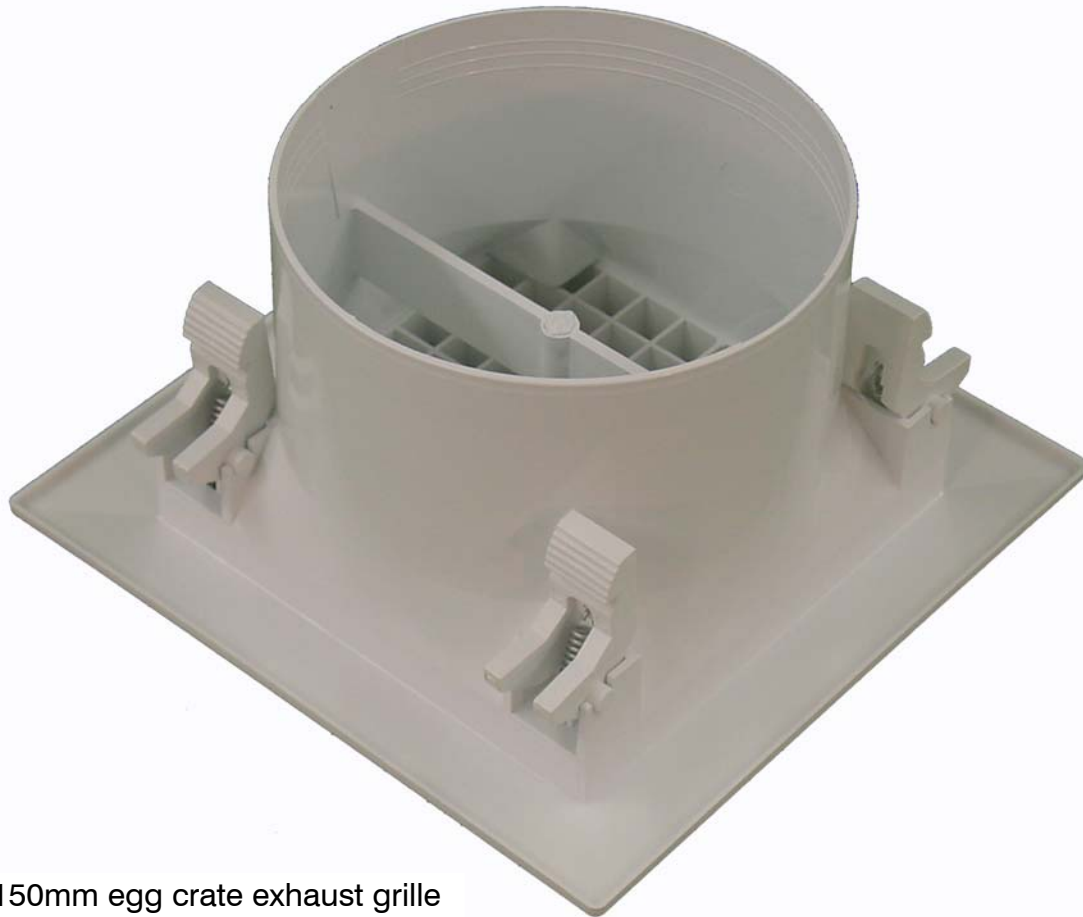
150mm egg crate exhaust grille